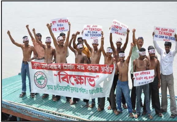
Protest against Big Dams www.demotix.com