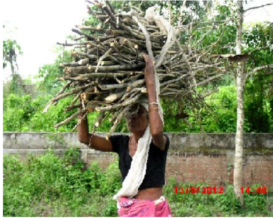
A Woman collecting Firewood at Biswanath (Sonitpur)