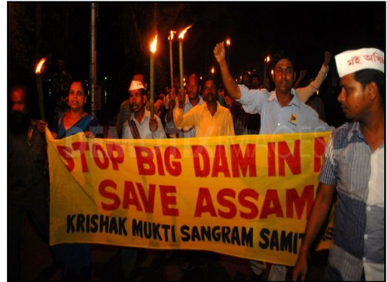
Protest against big dams by KMSS