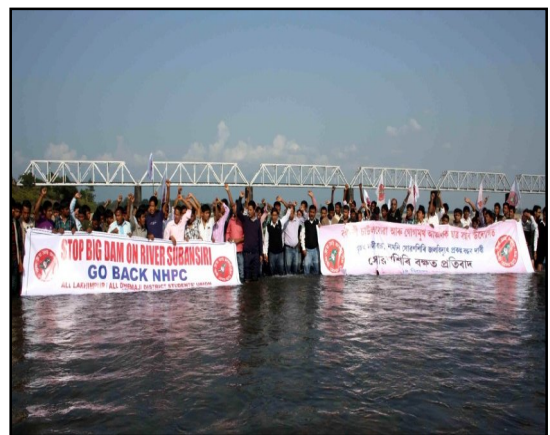
www.opendemocracy.net The Rhetoric of Narmada