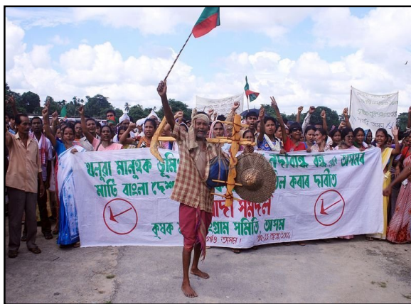
"Indigenous" protest of youths