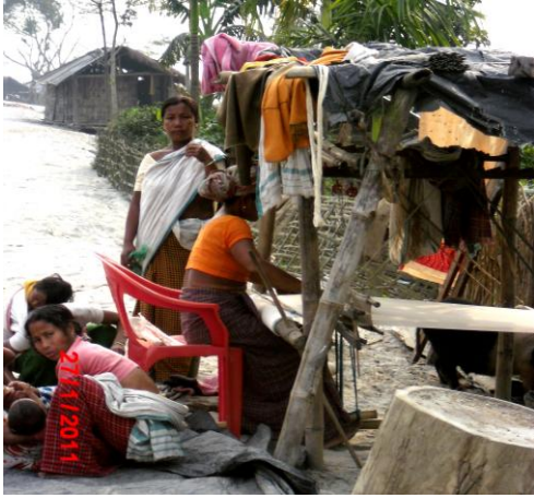
Women at Matmora (Lakhimpur) after devastating Flood