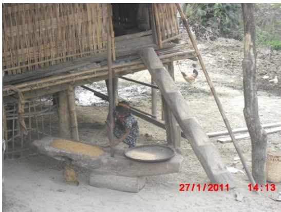
A girl Busy at Work at Matmora (Lakhimpur)