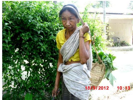
A woman Collecting Herbs from the forest at Biswanath (Sonitpur)