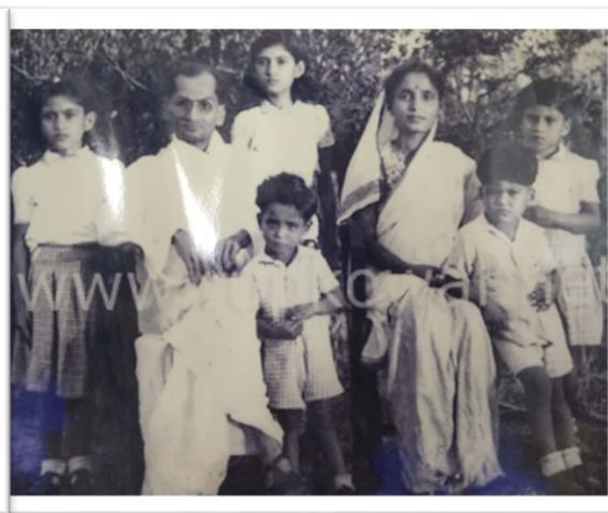
Figure 2 44