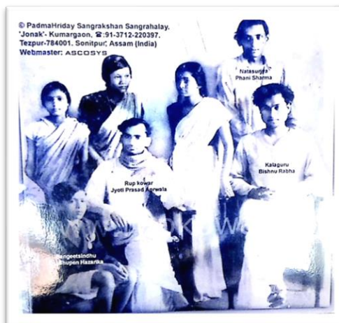
Figure 1. 43