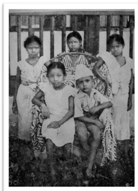
Figure 3 45