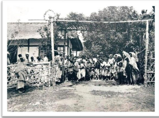
Nazira, Sivasagar, Courtesy: Assam State Musuem.