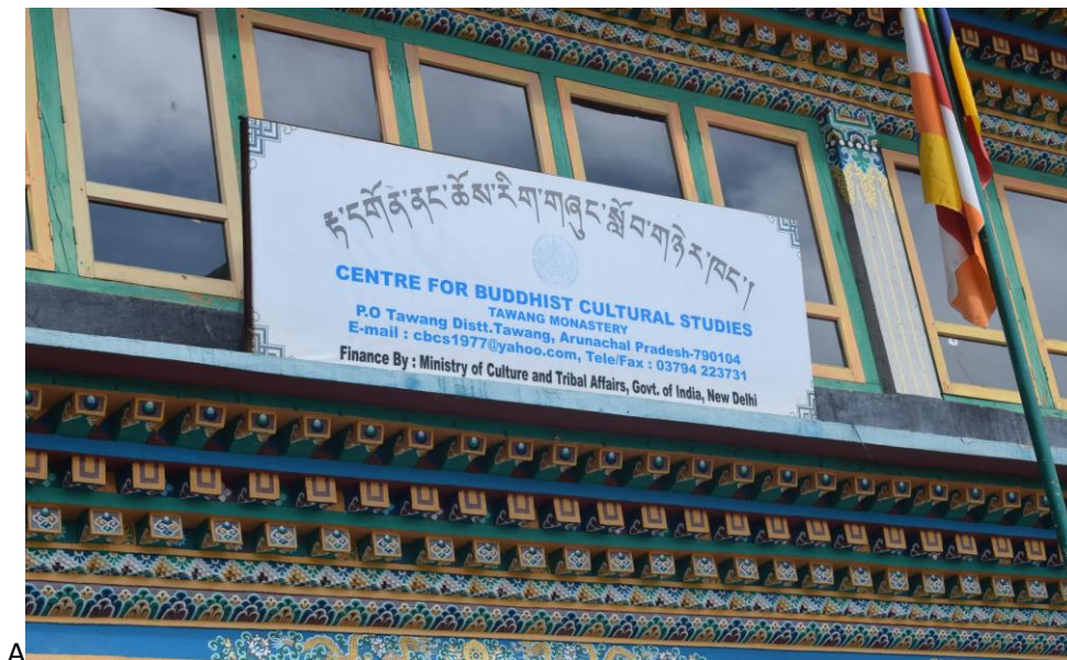
Sign board about the establishment of School in Tawang Monastery