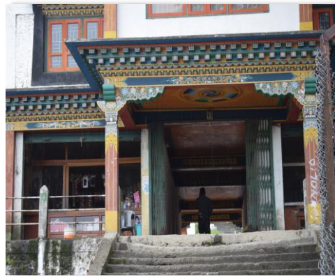
Entry gates of the Monastery