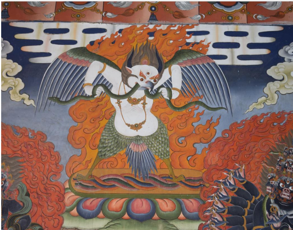
Painting of Lord Garuda