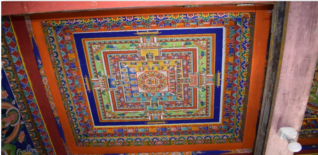
Pictures of different Mandalas 1 Painted and constructed by monks of the monastery