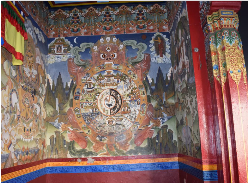
Painting of Wheel of Life