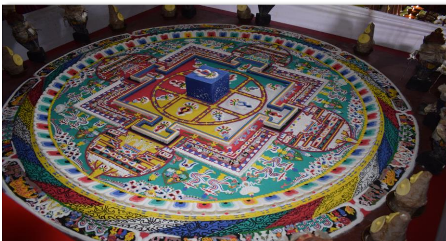
Different types of Mandalas