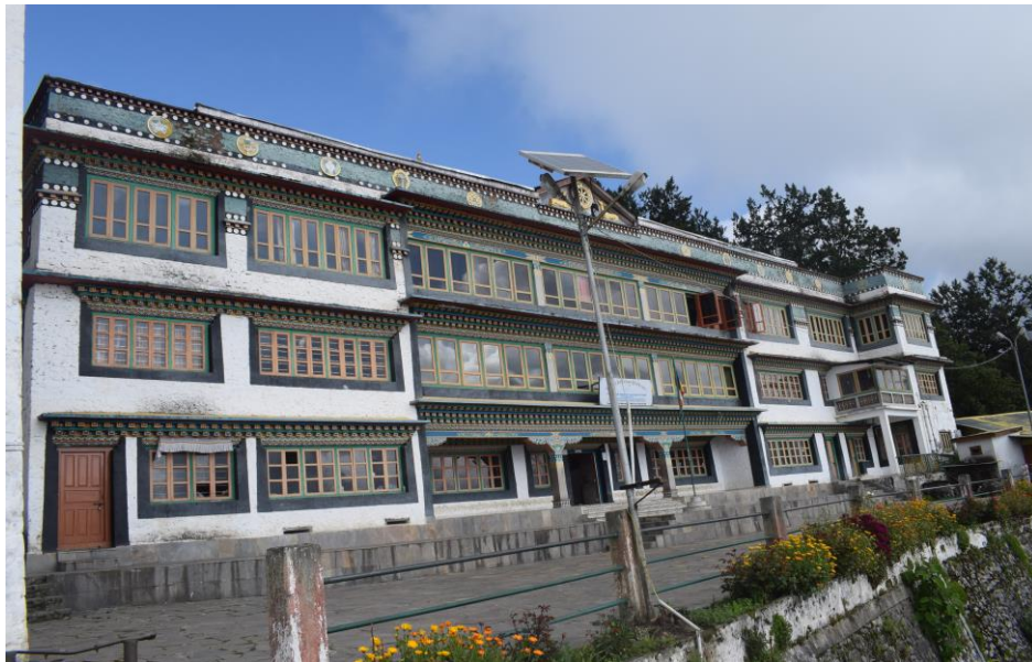
School Building of Tawang Monastery