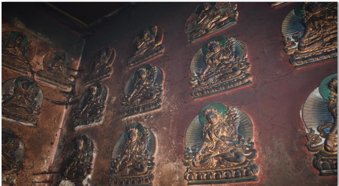
Wall Carvings of Gods and Goddess