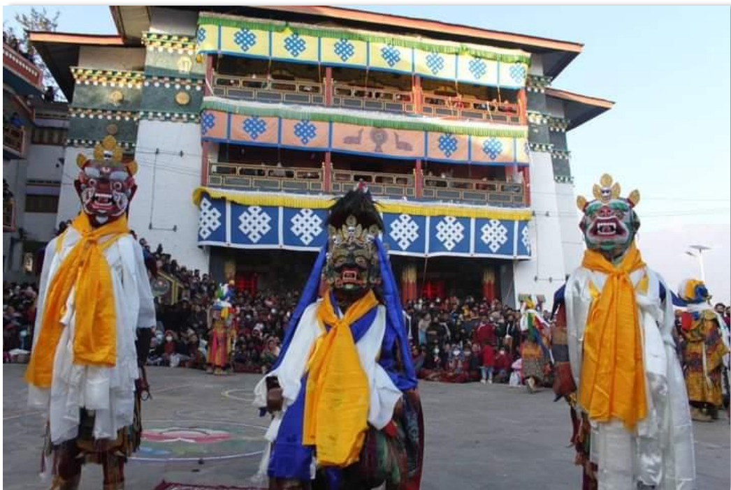
Picture of Main prayer Hall of Tawang Monastery