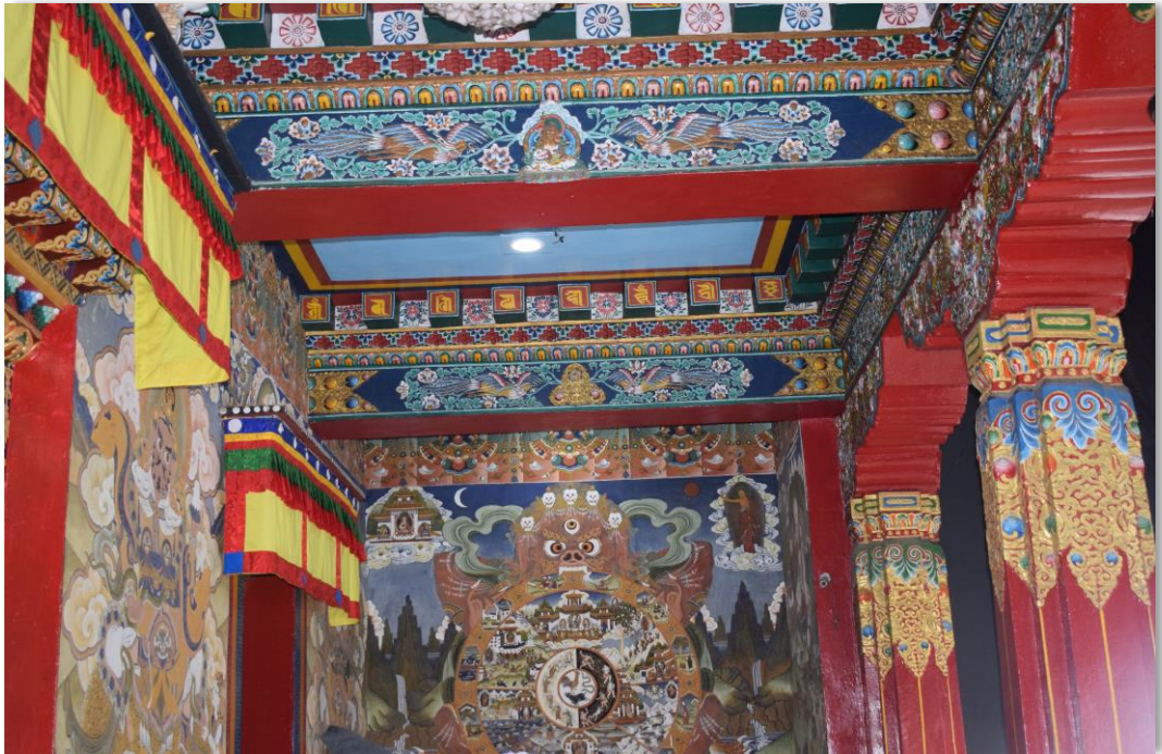
Picture of the pillars at the entry of monastery