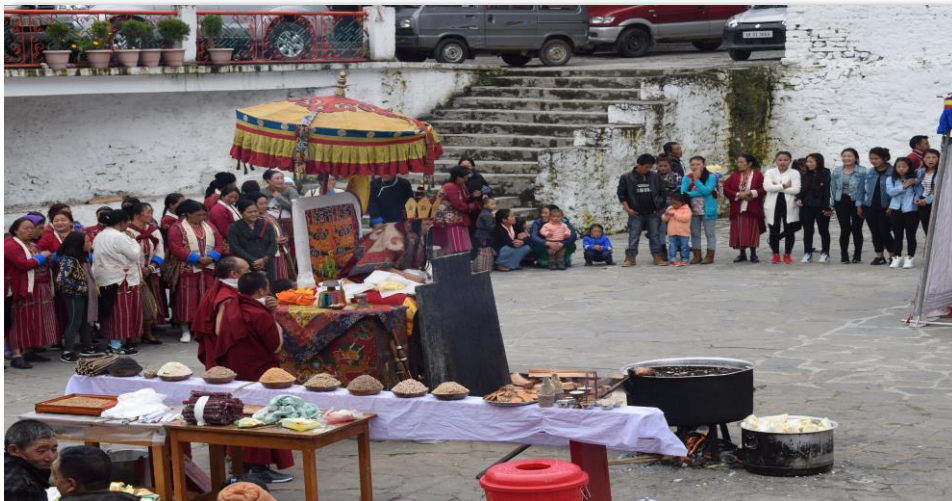
Sangdai Ritual being performed in the monastery by the Abbot and monks for the welfare and betterment of all sentient beings