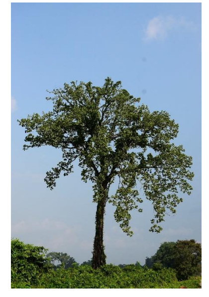
(I) Tetrameles nudiflora