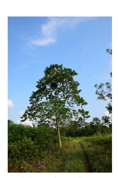
(D) Gmelina arborea