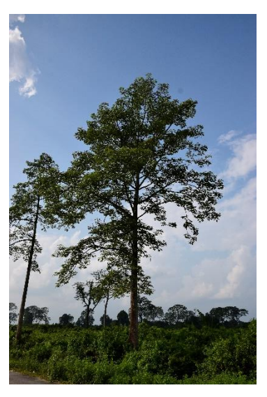
(B) Bombax ceiba