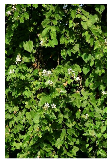
(A) Bauhinia purpurea