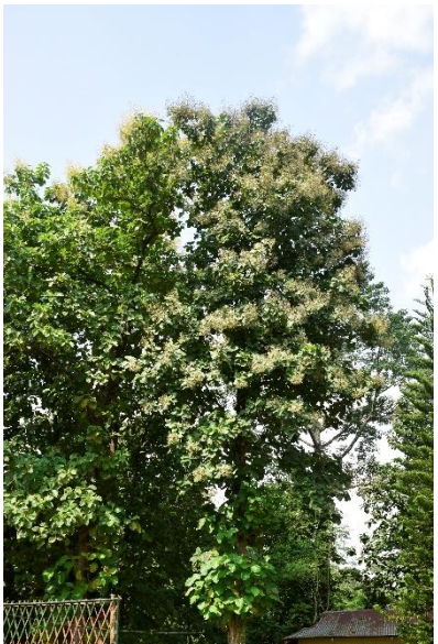
(H) Tectona grandis