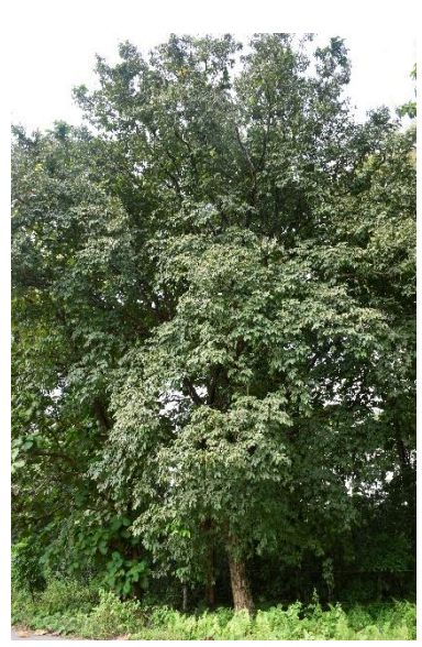
(E) Lagerstroemia speciosa