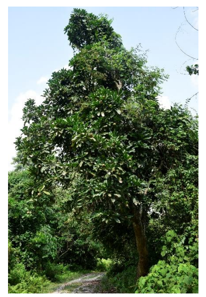
(F) Magnolia hodgsonii