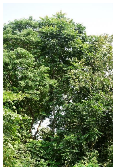
(J) Toona ciliata