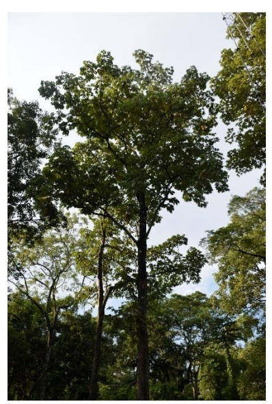
(G) Sterculia villosa